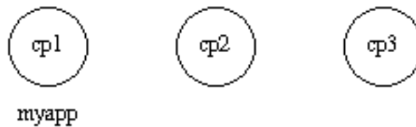
Figure 9.1: Application myapp - Situation 1

Similarly, the application must be stopped by calling application:stop(Application) at all involved nodes.